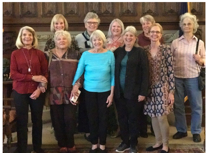
Ladies of the Class of 1964 walking the halls in October