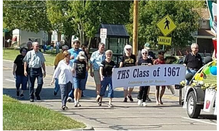
It was a beautiful, yet toasty, day for Homecoming 2017. The temperature didn’t stop the class of 1967, during their 50th reunion weekend, from walking the entire parade route.