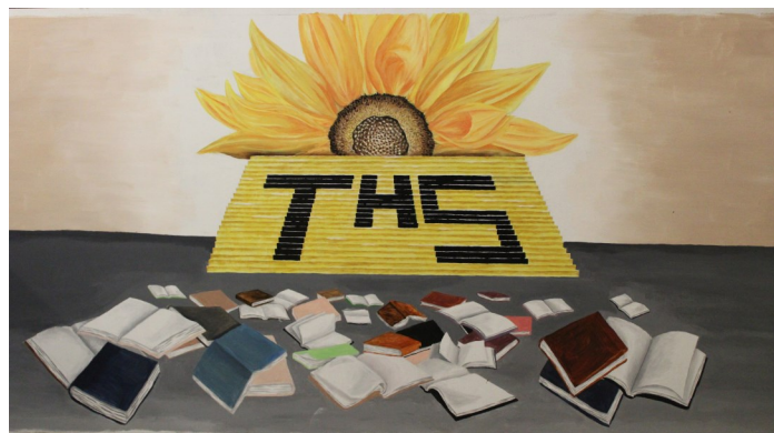
One of four (4' x 8') murals located at the Western Plaza by Alessandra Chavez (2018).

If you know a Topeka High graduate who should be considered for the THS Hall of Fame please send their current biographical information and 2 signatures of endorsement to: THS Historical Society, 800 SW 10th Ave, Topeka, KS 66612