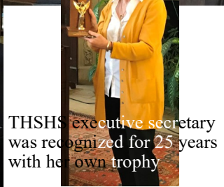
THSHS executive secretary was recognized for 25 years with her own trophy