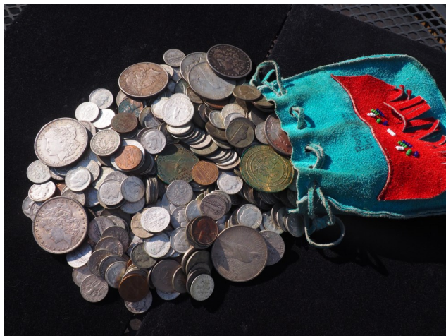
Collected from the grass in the air courts from one former THS employee and his family during the 50's and 60's

Here's a fun one for all of us! The statute of limitations has long passed by on this minor high school infraction, so you may all confess your past deeds. Are you one of the many Trojans who pitched pennies (or other coins) into the courtyard when the teacher wasn't looking? Apparently a lot of you did, because it has been a little known secret that you could find money in the grass in the two air court openings in the center of the building. It was common practice for teachers to keep the windows open during the hotter days of the spring and fall, and the mischievous deed was bound to happen. Boys will be boys (and some girls, too, we suspect). One can easily imagine; the window is open, the teacher is either out of the room temporarily or better yet, busy writing on the blackboard, and the cute girl across from you or your best