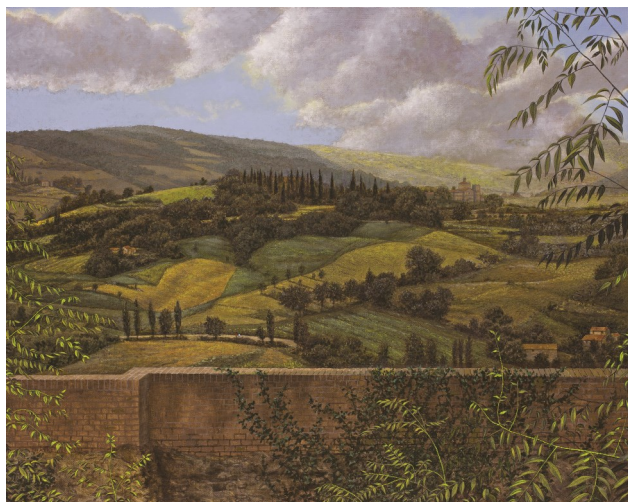
Homage to Urbino 27" x 34" oil on linen painting by Walter Hatke

This painting was originally titled From Urbino , initially completed in 1989, prior to reworking parts of the composition in 2014, at which time the title was changed to Homage to Urbino . The general composition was left largely intact. Significant changes were made to the sky, background, and castle wall. Specifically, the clouds were altered and elaborated somewhat; subtle modifications and clarifications were made to the background landscape (e.g. the human figures on a road); the wall was shifted to make its line parallel to the bottom edge of the painting, vines and foliage were added to create a smoother transition to the landscape and enhance a greater sense of special relationships.