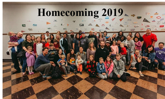
THS Class of 1999 and their families walking the halls during their reunion weekend.